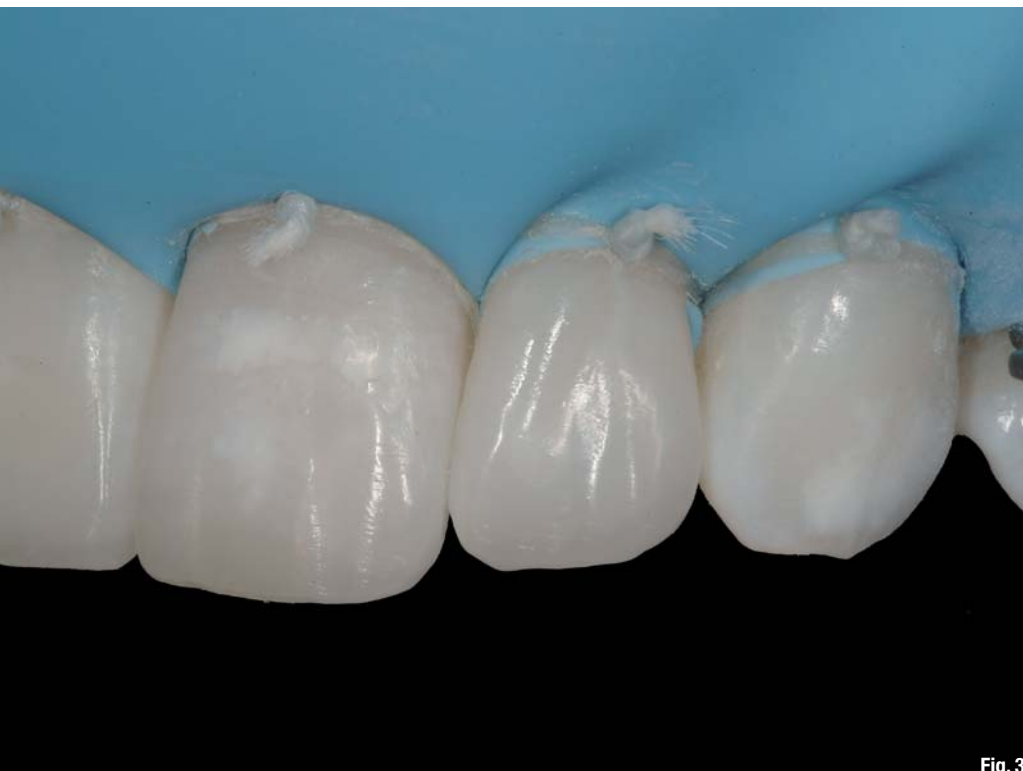
Fig. 3I_Detailed view of the corrected central and lateral incisors, using minimally invasive approach with direct composite.

Fig. 3m_Post-operative view showing a more harmonious smile configuration and uniform tooth colour.